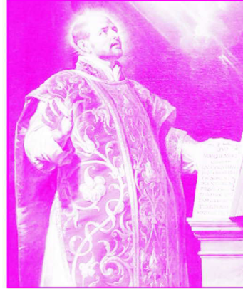
ST. LOYOLA IGNATIUS